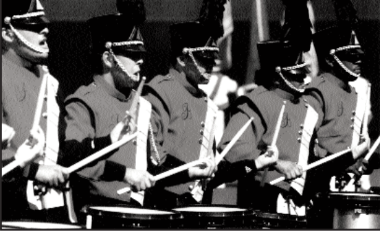
put this type of show together. Syracuse Brigadiers, 2002.

_____ It is a piece of the past that reflects that this group of musicians, no matter how much more they achieve, will always remember where they came from.